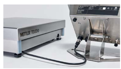
Terminals with SICSpro interface that directly connect to PBK9: IND890, IND570 (as per Q4/2015); ICS4_5; ICS685; ICS4_9, ICS689