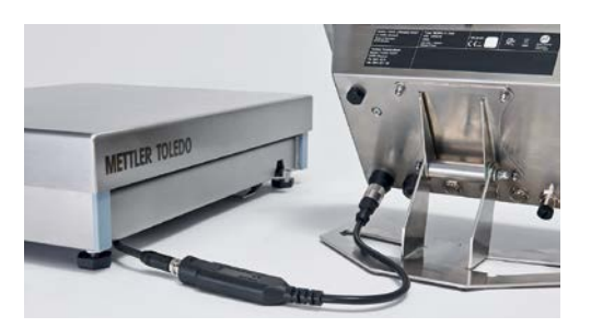
Terminals with IDNet interface that require ACC409xx adapter: IND690(xx); IND4_9(xx); IND560(xx); IND780(xx); IND780(xx); ID5; ID7; ID30 (ID5, ID7 and ID30 for non-approved applications only)